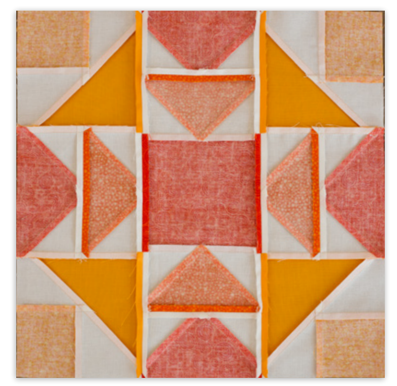
Refer to this image for pressing directions

Subscribe to our YouTube channel so you don't miss a single video!